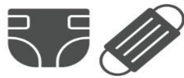
Diapers and Hygiene Products