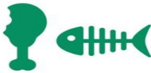
Meat and Seafood